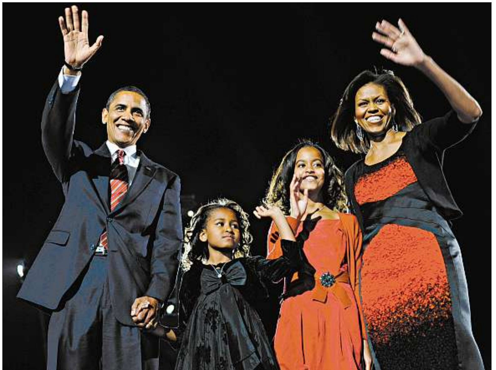
The new first family: Barack Obama and his wife, Michelle, and daughters, Sasha, 7, and Malia, 10, greet supporters in Chicago on Tuesday.