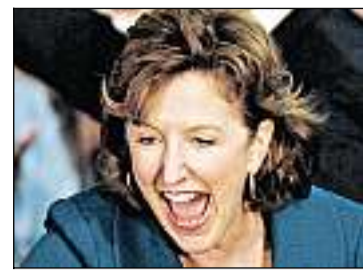
Kay Hagan: Defeats Elizabeth Dole.