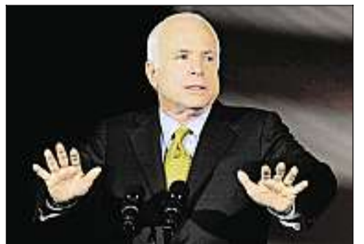
John McCain: At outdoor rally in Phoenix.